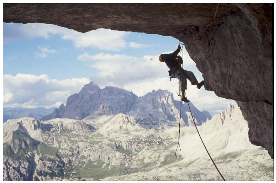
Aiding on Bellavista Pitch 7 (F8c/E10 7a)